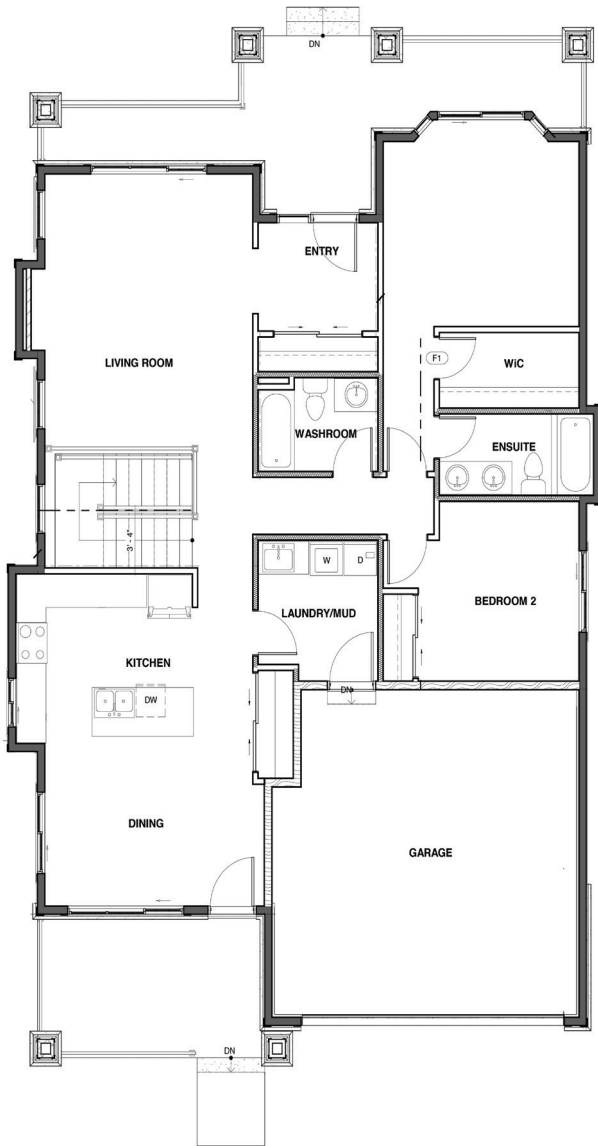
main floor 1,497 SQ.FT.